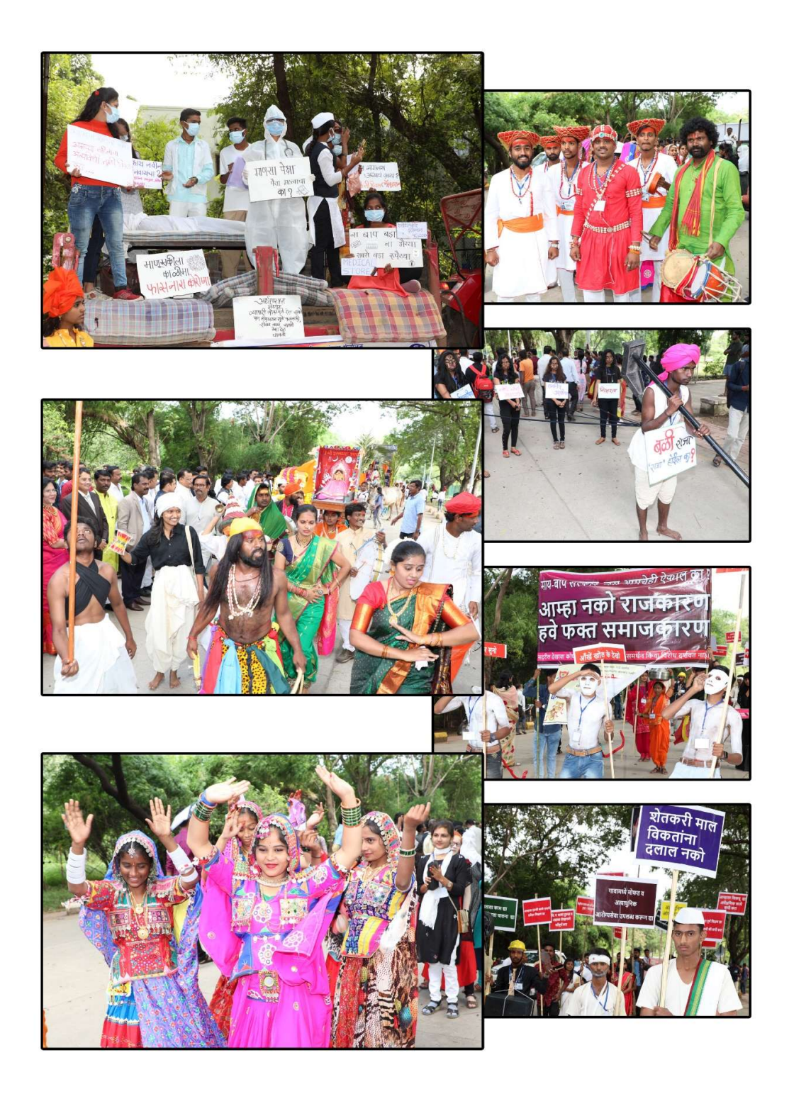
During Yuva Mahotsav 2022 Shobha Yatra, students showing their expressions.