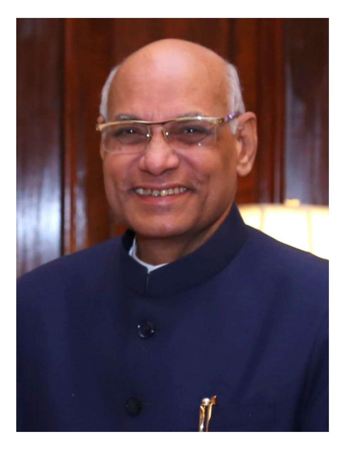
Hon'ble Chancellor (Chairman)Shri. Ramesh Bais